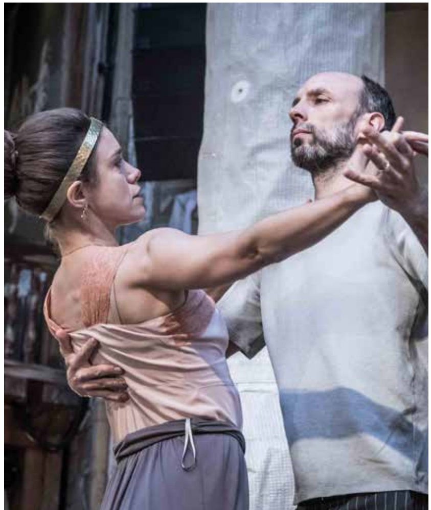
Goneril and Albany