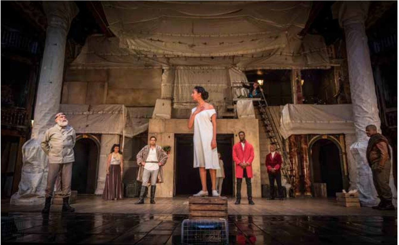
Lear, Regan, Oswald, Cordelia, France, Gloucester and Cornwall