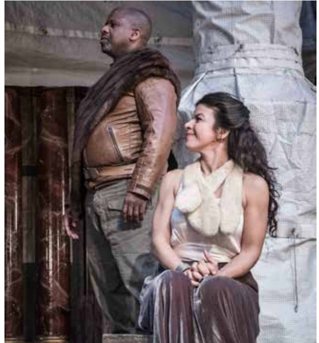
Goneril and Cornwall