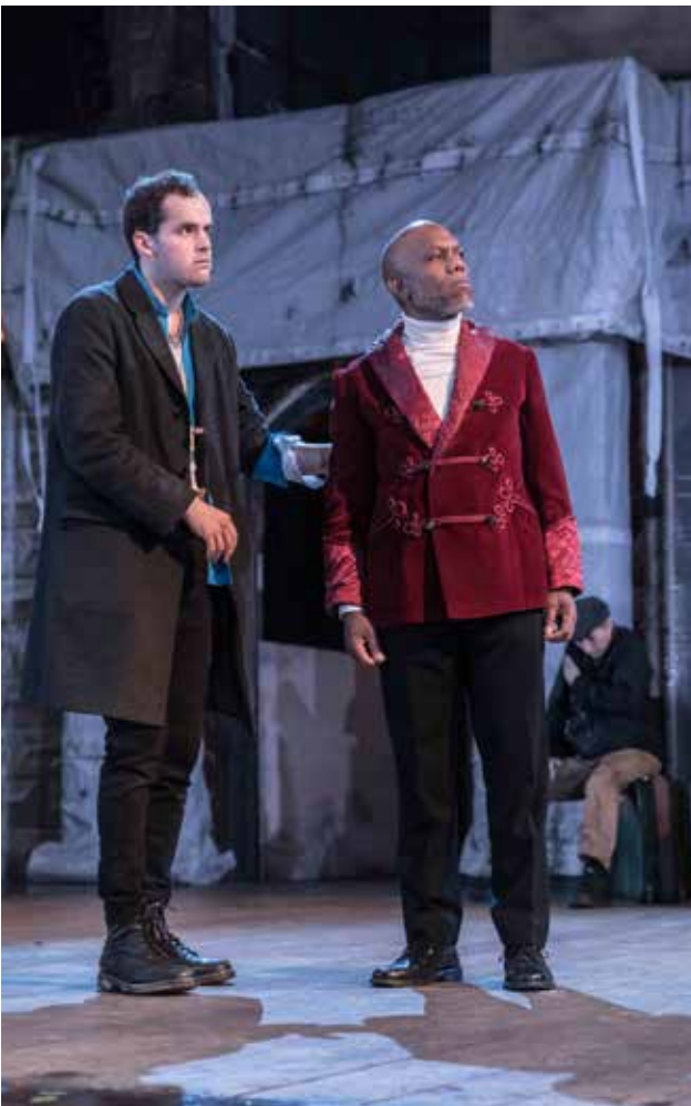
Edmund and Gloucester