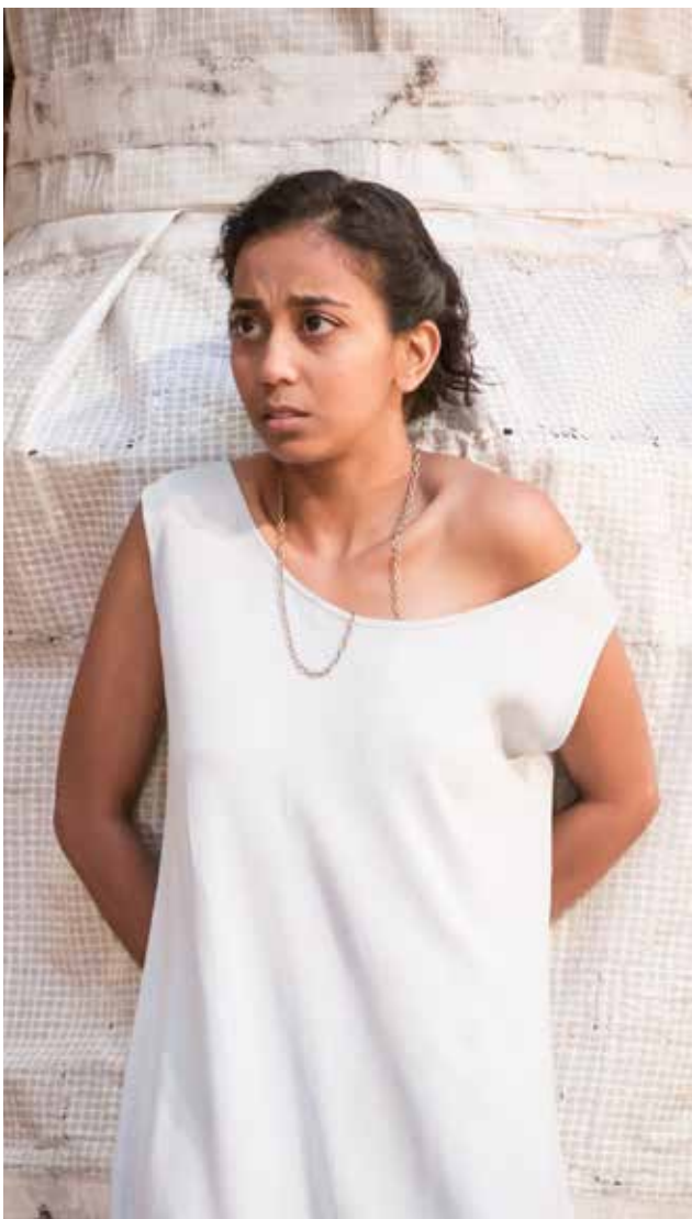
Cordelia, Lear's youngest daughter